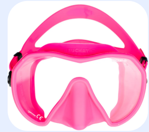
Beuchat Maxlux Small Mask