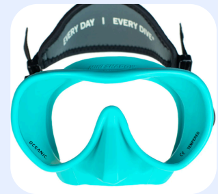
Oceanic Mini Shadow Mask